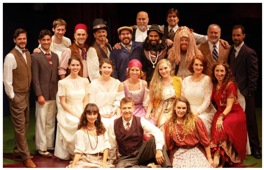
Ensemble of "Midsummer Night's Dream" at New American Theatre.

From disco-dancing fairies to mystical Gypsies of 1930s Greece, the summer theater season wouldn't be complete without multiple interpretations of Shakespeare's A Midsummer Night's Dream to quench our appetite for the Bard's most beloved comedy.