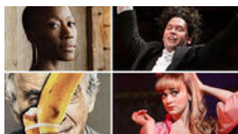
CHEAT SHEET: Spring Arts Preview