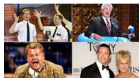
TONYS 2013: Nominees, photos and full coverage of the awards