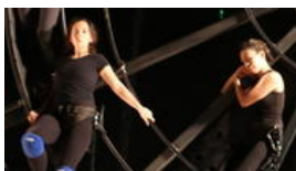
Getty Villa to sport a giant steel wheel for 'Prometheus Bound'

Even by the Troubies' typically reliable comic standards, this commedia dell'arte-infused mash-up of classical lit and pop culture is an exceptionally hilarious and energetic romp.